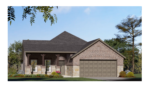
1849 B with Stone