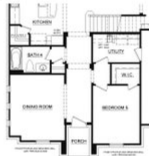
OPTIONAL BEDRM. 5 w/BATHROOM 4 ILO STUDY AND POWDER