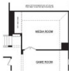
OPTIONAL MEDIA ROOM