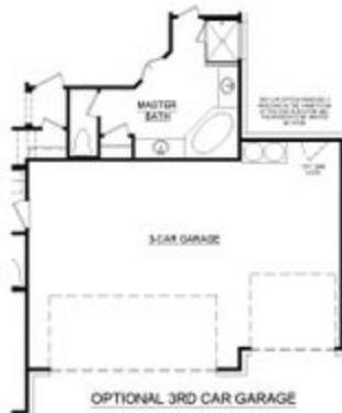
OPTIONAL 3RD CAR GARAGE