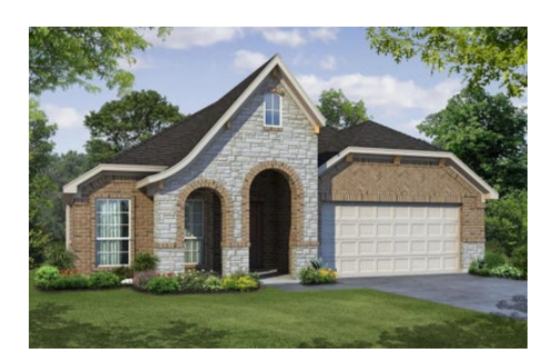
2065 B with Stone