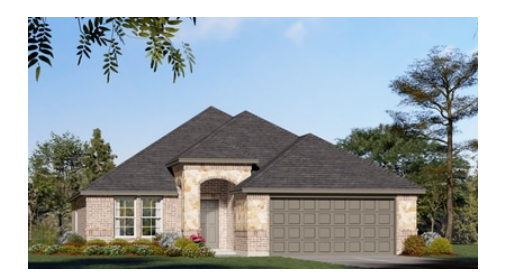
1849 A with Stone