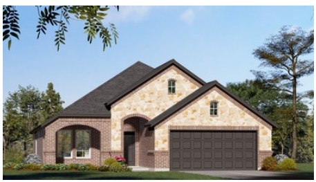
1849 C with Stone