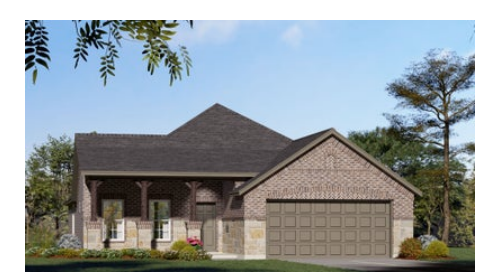
1849 B with Stone