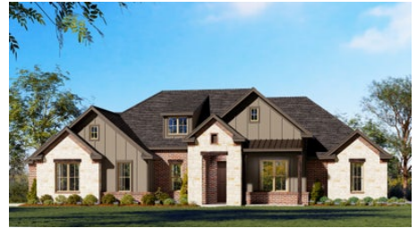
2623 C with Stone