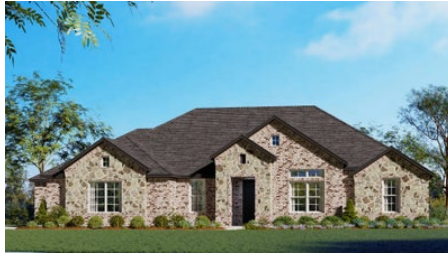
2623 A with Stone