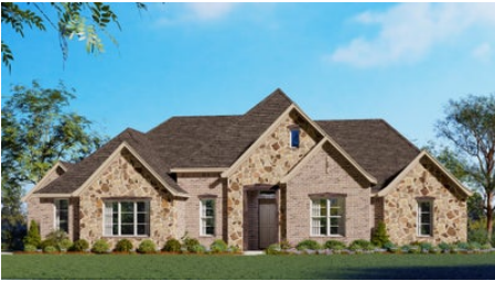
2623 B with Stone