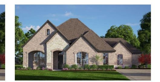
2199 C With Stone