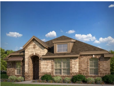
2129 B with Stone