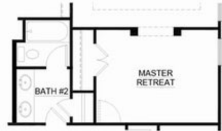
OPT. MASTER RETREAT ILO BEDROOM 2