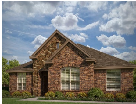
2129 A with Stone