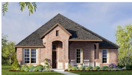
2129 D with Stone