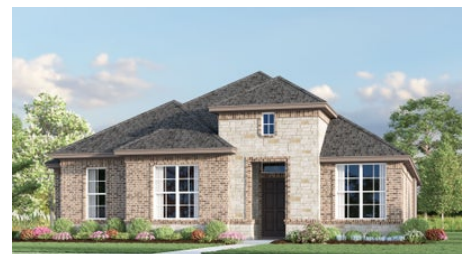
2129 E with Stone