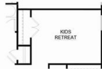
OPT. KID'S RETREAT ILO BEDROOM 2