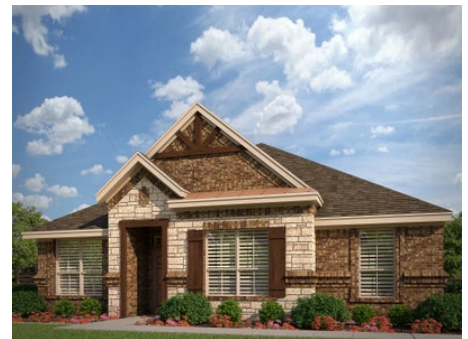
2129 C with Stone